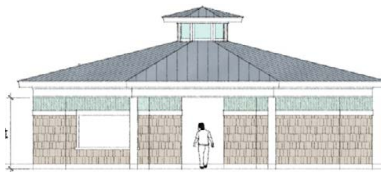
The $1.2 million park expansion project is financed by a combination of town funds with a $600,000 match from the County, along with corporate sponsorships, naming rights, and private donations to complete one of our long-awaited goals.