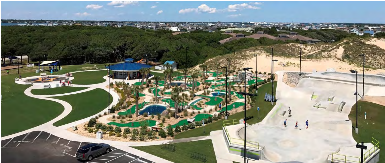
Town Park Opens