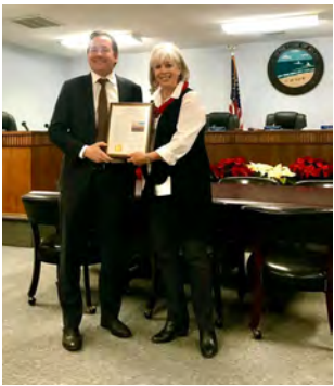
Pictured: Mayor Ellen Glasser, of our Sister City Atlantic Beach, FL, administering the Oath of Office to Mayor A.B. "Trace" Cooper, III.

I am advocating for some changes to our development ordinances that will require the use of better construction materials in Atlantic Beach. But, better materials are not enough. We also need better design. Too many buildings are being built that were clearly designed by builders as opposed to architects. We have great builders in our area, but expertise in construction does not equal expertise in design. Builders often want simple buildings that are, first and foremost, efficient to construct. An architect, however, will design a space around how you live and that will look great inside and out. Design is often the least expensive part of a project, but I believe it is the most important. If you are planning on building in Atlantic Beach, your first call should be to an architect. Our town will continue to evolve. To ensure our evolution achieves this goal of quality over quantity we must be proactive. We must plan. We must think strategically. All of which means we must look forward in 2020. We should do so, however, with a respect for our past. To me, the future of Atlantic Beach looks a lot like our past, but even better.