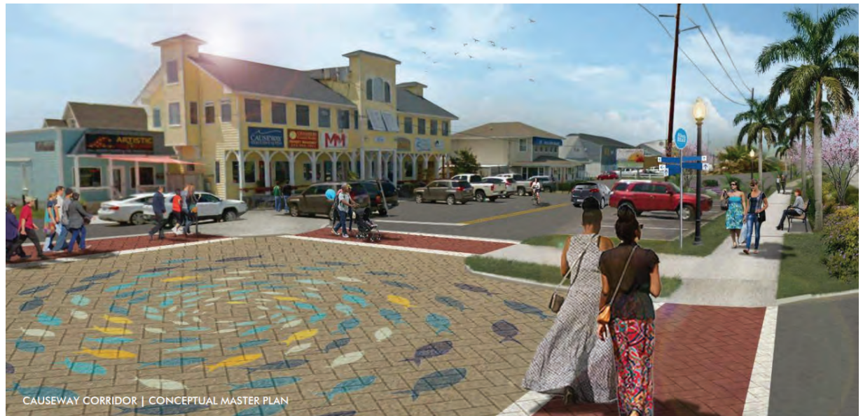
CAUSEWAY CORRIDOR | CONCEPTUAL MASTER PLAN

>> PICTURED BELOW IS A DIGITAL RENDERING OF WHAT THE INTERSECTION AT MOONLIGHT DR., PARALLEL TO THE CAUSEWAY, COULD LOOK LIKE