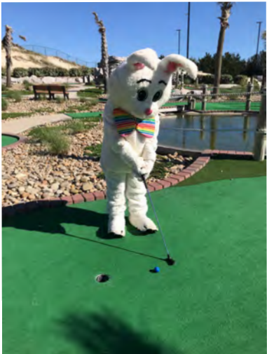
^^Join us at this year's Easter event at the Town Park on April 4, 2020

Due to the success & popularity of the digital sign at the Circle, a new double-sided digital message board was installed at the entrance to the park in May! This message board features Town events, park programs & specials all year round.