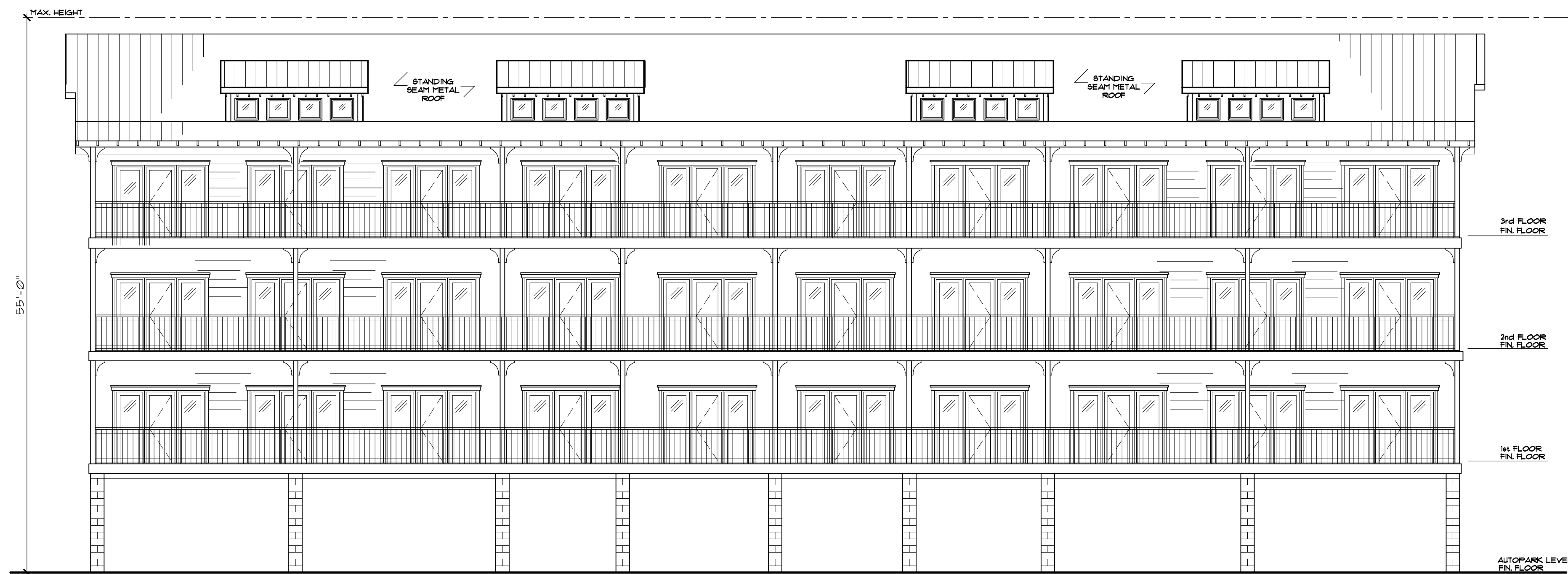
4 REAR ELEVATION A-4 SCALE: 1/8" = 1'-0"