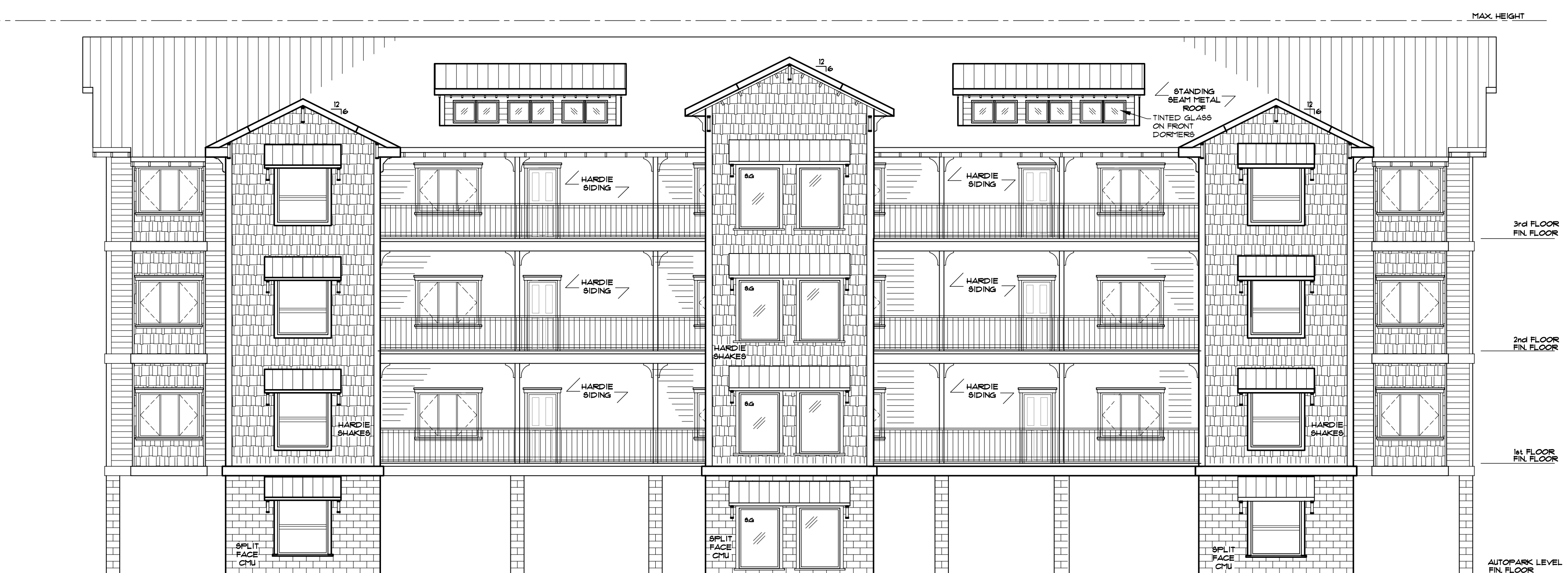
1 FRONT ELEVATION A-4 SCALE: 1/8" = 1'-0"