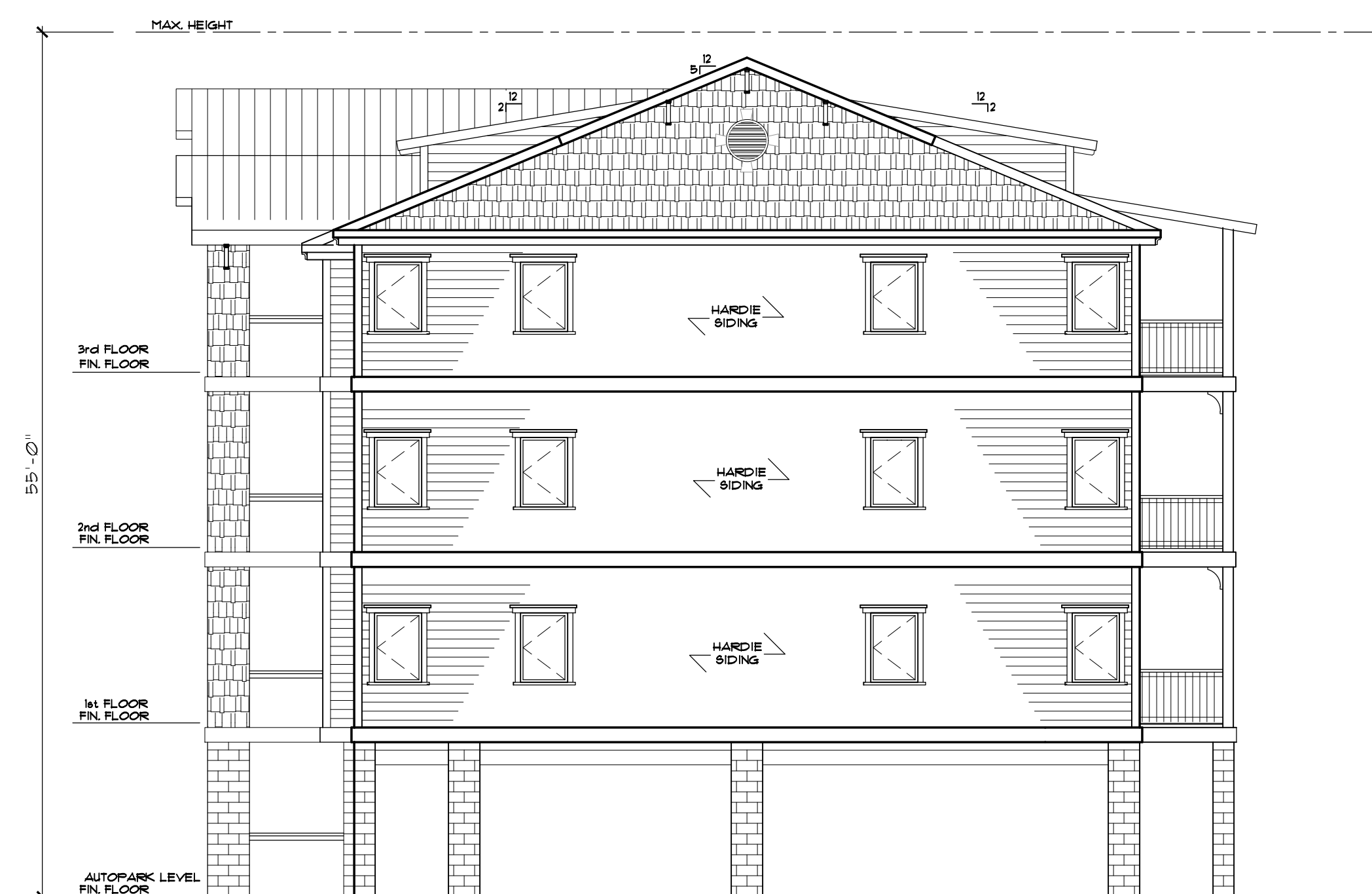
2 RIGHT SIDE ELEVATION A-4 SCALE: 1/8" = 1'-0"